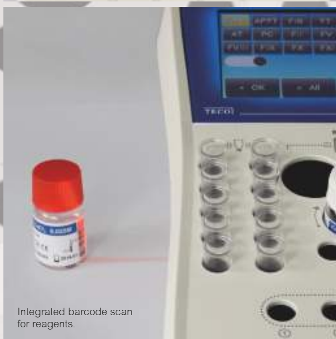
Integrated barcode scan for reagents.